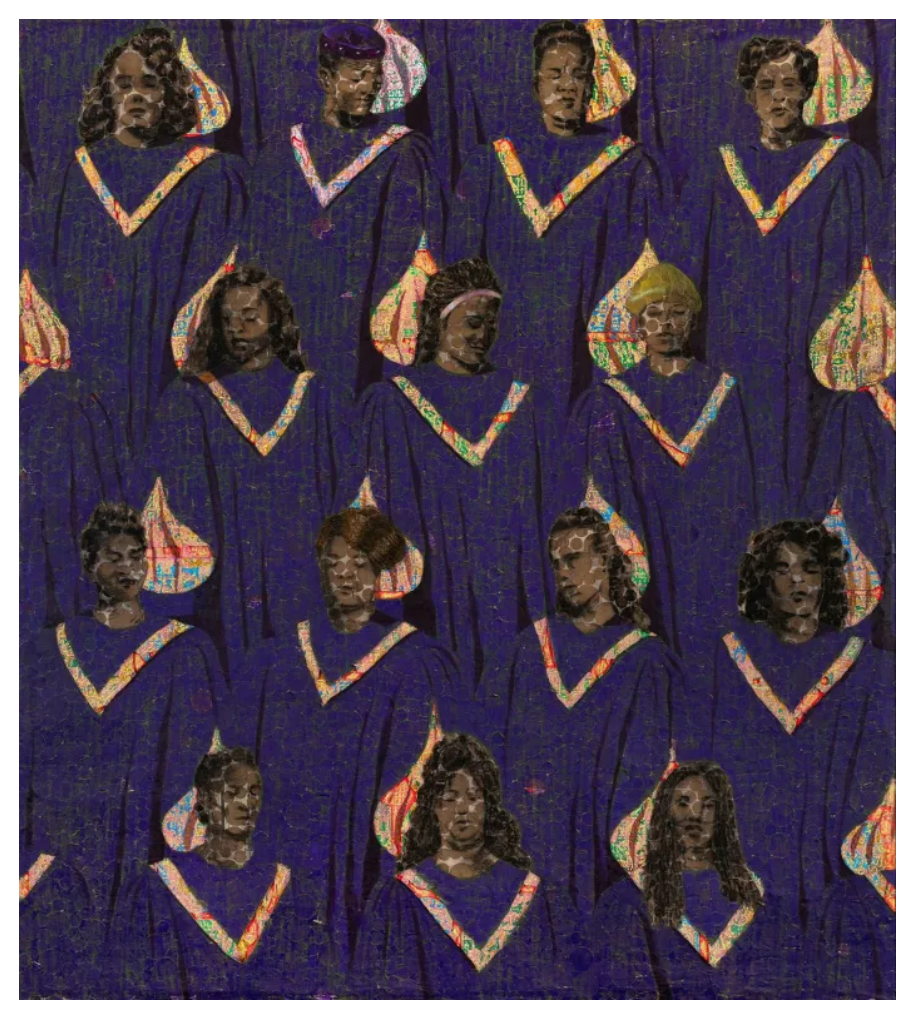
'Chorus of Maternal Grief' (2020)

"I once heard optimism described as a survival instinct," Fordjour replies when asked if he is optimistic for social change. "I am probably more concerned with survival, especially as an artist. The hope is that your life's work survives . . . the oeuvre itself is decidedly more dubious and questioning."