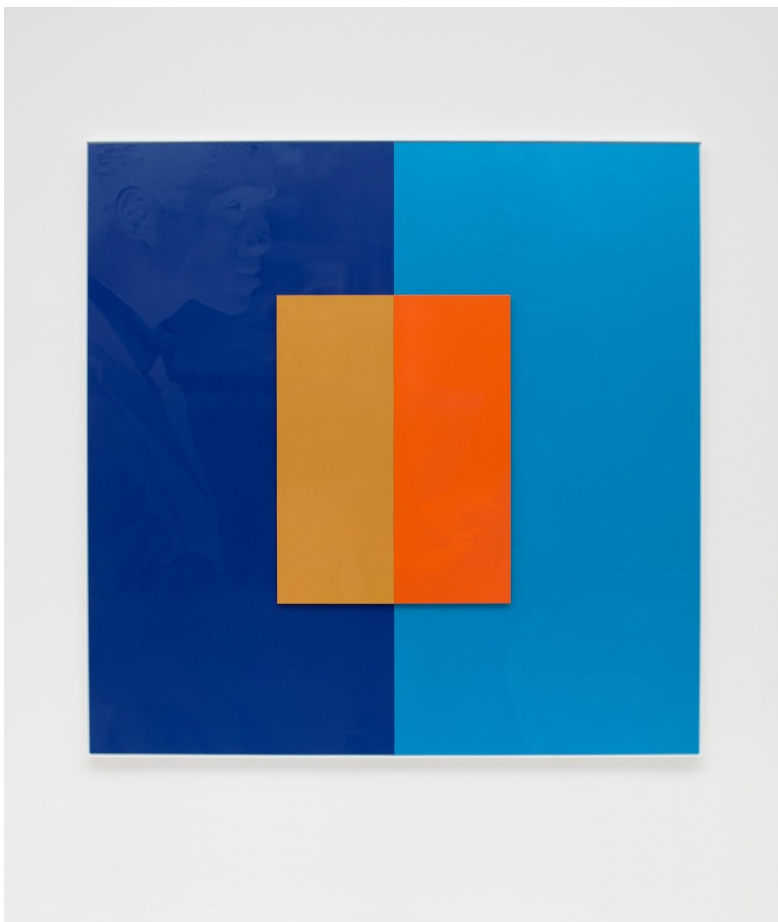
"'C'est si bon' (Le Harmonie del Colore)" by Hank Willis Thomas, 2019. UV print on retroreflective vinyl, mounted on Dibond. Photographed without flash.

The composition is reminiscent of Edouard Manet's 1863 painting "Olympia," featuring a reclining white woman attended by a black maid. In Manet's image, the maid's skin is so dark that it nearly blends into the background. The entirety of Thomas' image is similarly hard to see. His use of the color bar refers to calibrating color on the screen, which helps determine what and who is visible.