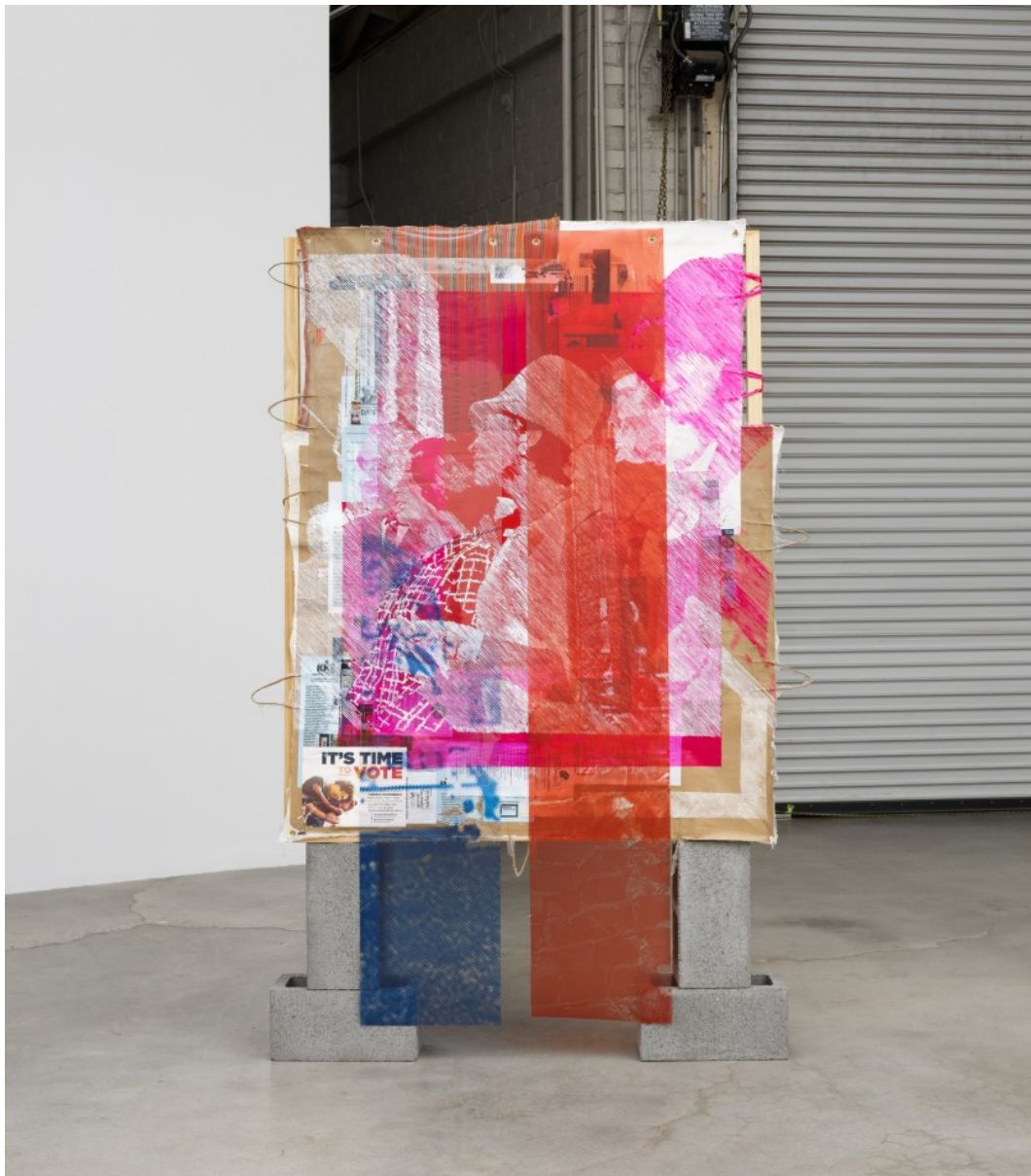
“Ecology of Fear (Abrams for Governor of Georgia) (Negro Women Wait to Congratulate LBJ)” by Tomashi Jackson, 2020. Archival prints on PVC marine vinyl, Pentelic marble dust, acrylic paint, American election fliers, Greek ballot papers, paper bags, muslin.

The imagery, drawn from political publications and signage as well as archival and family photographs, is dense, cacophonous and overlapping to the point of incoherence. Yet clearly at the center is a hot pink vertical rectangle framed by two more rectangles in different shades of yellow. It’s reminiscent of the concentric compositions of German émigré artist Josef Albers in which he mapped out vibrating gradations of color.