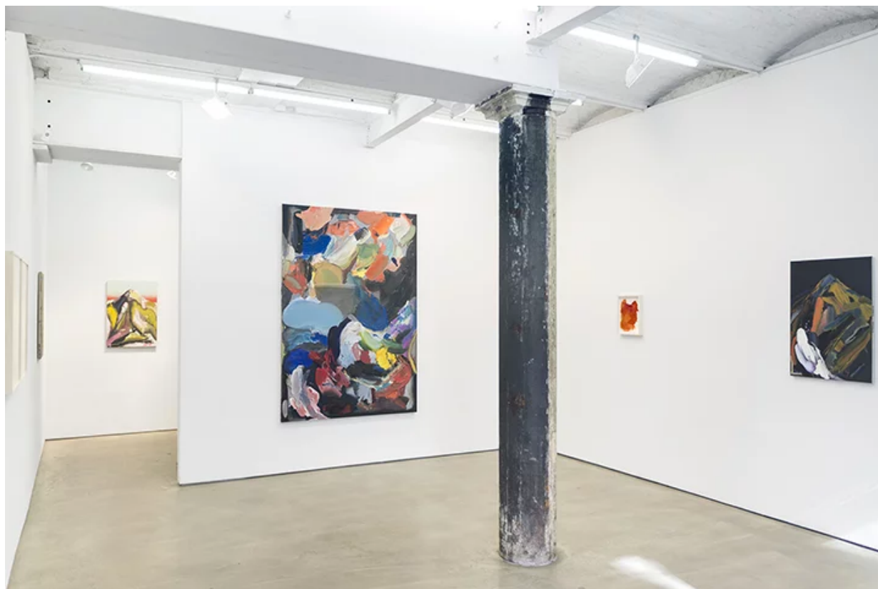
Installation view of Andy Woll's "Western Wear" at Denny Gallery, New York.