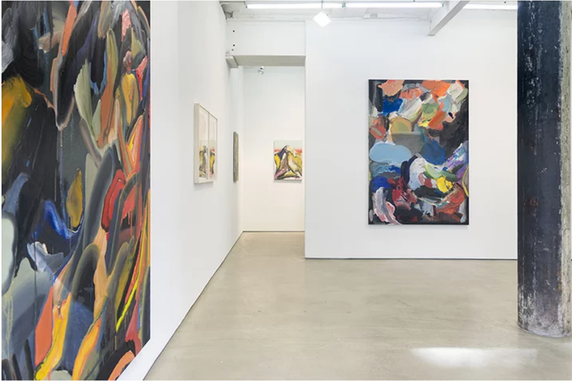
Installation view of Andy Woll's "Western Wear" at Denny Gallery, New York.