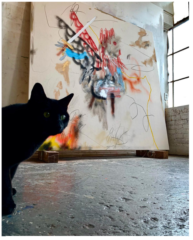
View More on Instagram