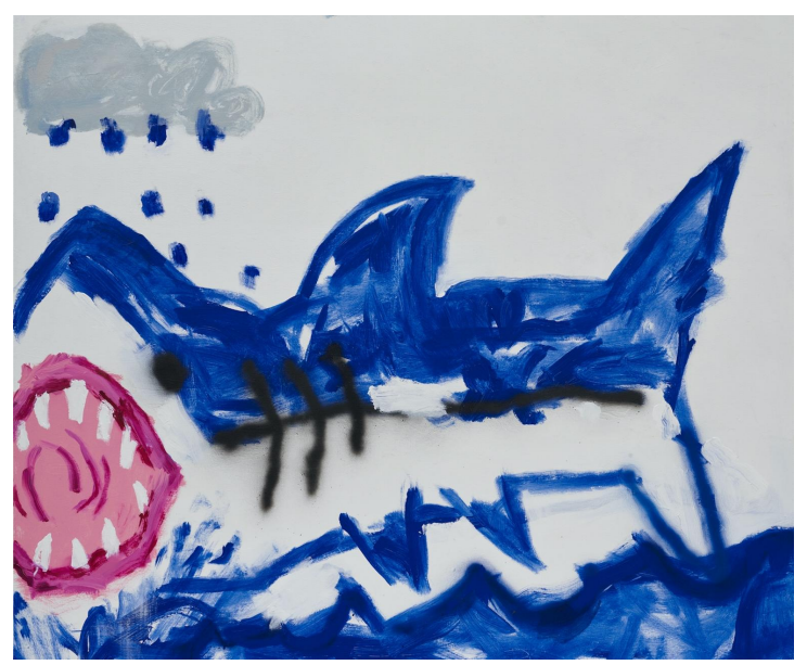
© ROBERT NAVA. COURTESY OF PACE GALLERY. PHOTOGRAPHY BY HEIDI BOHNENKAMP.

Robert Nava, Detail of Splash Cloud, 2020. Acrylic on canvas, 72 × 72 inches.