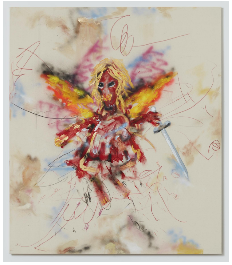
© ROBERT NAVA. COURTESY THE ARTIST AND VITO SCHNABEL GALLERY.

Robert Nava, Seraphim and Clouds, 2020. Acrylic and grease pencil on canvas 85 x 73 inches.