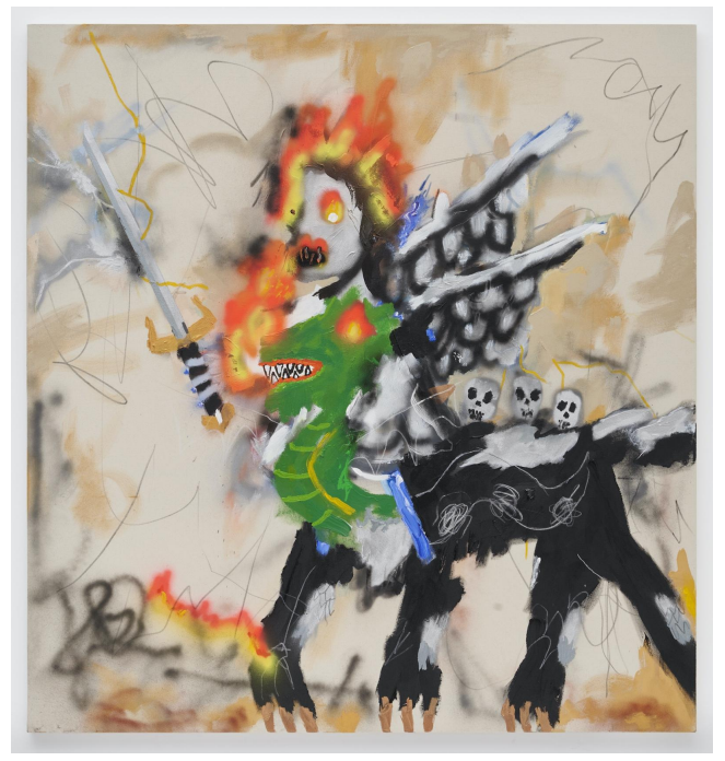
© ROBERT NAVA. COURTESY PACE GALLERY. PHOTOGRAPHY BY HEIDI BOHNENKAMP Robert Nava, Lightning Wolf Skull Rider , 2020. Acrylic and grease pencil on canvas, 68 × 72 inches

PL: What led you to start drawing and painting otherworldly creatures, like angels, dragons, and other mythological beasts?