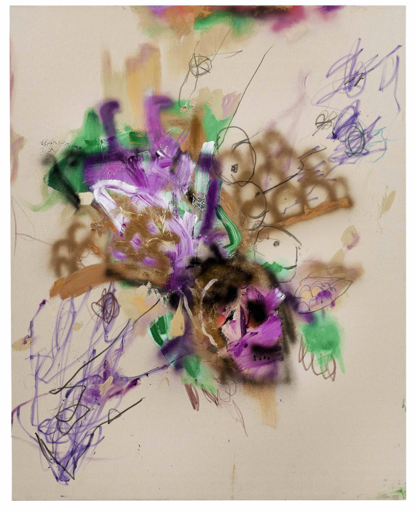
© ROBERT NAVA. COURTESY THE ARTIST AND VITO SCHNABEL GALLERY.

Robert Nava, Safety Angel 4, 2021. Acrylic and grease pencil on canvas 60 x 48 inches.