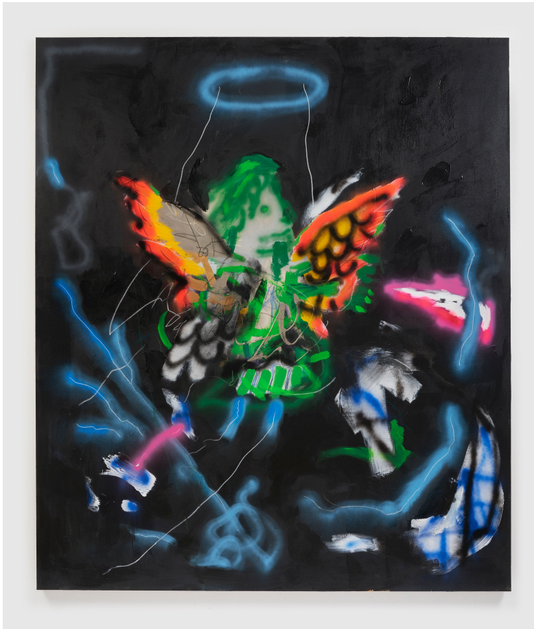
Robert Nava, Night Storm Angel , 2021, Acrylic, grease pencil, and crayon on canvas, 85 x 73 inches (215.9 x 185.4 cm)

headline or kicker. Not unless the viewer chooses to project or reflect on their own identity, which is of course valid. Does this mean the show can't possibly be considered as interesting, vital or important as crisis-addressing or identity-reinforcing art at this time, that is, in this ongoing watershed moment? Is Nava's new series (hypothetically) just child's play by comparison? Just taking up space? A cash-grab? A distraction? 15 great big trivialities on canvas?