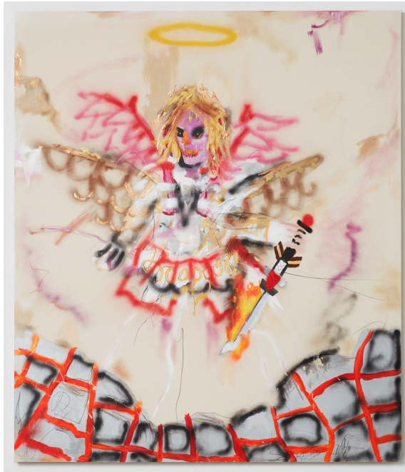
Robert Nava, Volcanic Angel, 2020, Acrylic and grease pencil on canvas, 85 x 73 inches (215.9 x 185.4 cm)

The angel or seraph as an archetype and symbol, caught in a Pop-Jungian uroboros, which is connected to but by no means tethered to Judeo-Christian dogma, is a clever and timely unifying subject that compels the viewer to look within as opposed to without. This is an essential process and step in collective human evolution at this critical moment in history. The quantity of paintings as well as their scale, diversity of color, form, texture and mood, provides a plethora of positive and at times surprisingly intense trigger points for individuals across the vast human spectrum. The show is an open invitation to all races, ages, genders and nationalities to engage with art and the nature of “reality” and all its complexity without boundaries, mandates, rules, codes or restrictions; without guilt, shame, pressure or fear.