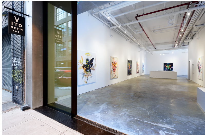
Installation view: Robert Nava, Angels , Vito Schnabel Gallery, New York, February 25 – April 10, 2021 © Robert Nava; Photo by Argenis Apolinario; Courtesy the artist and Vito Schnabel Gallery.