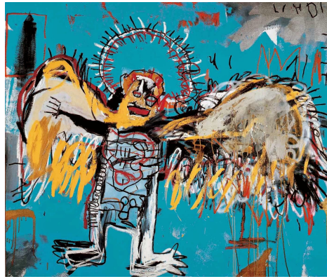
Jean-Michel Basquiat, Untitled (Fallen Angel), 1981